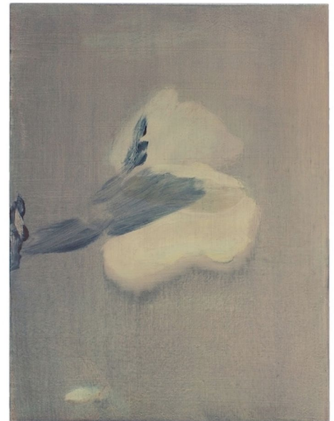
Ascent, Blå Huset – Karen Roulstone 2015 Oil on wooden panel 30 x 40 cm

Just as Helen Frankenthaler's 'soak stain' technique transformed the way in which the materiality and properties of paint might be understood, I think Nicholls' distinctive engagement with watercolour draws us into its liquidity in the dilution and dispersal of pigment which rides on the play between chance, control, and containment on a monumental scale. There is something lyrical about the transformative nature of the process of solid pigment dissolving into liquid and the evaporation back to dry sediment again – the transition of states of matter, particles, and their movements. The lusciousness of the pigments captivates and transports the viewer. What I am left with is a residing sense that, in this moment of animation, translation, and resolution, her paintings come to me as the ethereal colour of liquid thought.